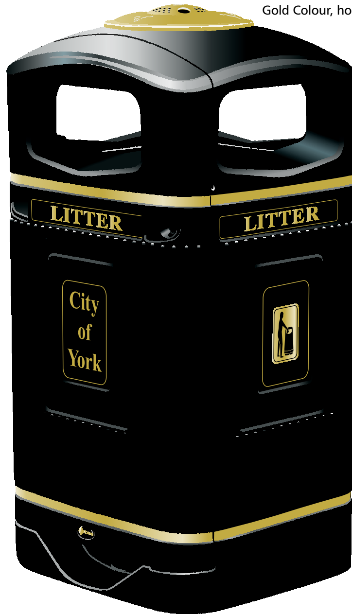
Gold Colour, hood ashtray